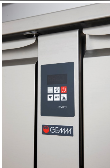
Back panel control board