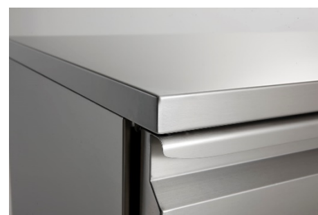
Detail of s/s worktop edge